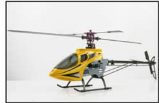
EK1H-E015(碳纤维版carbon fibre) BELT-CP