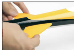
18.将两边平衡翼粘好 Stick both sides of the balancing fin.