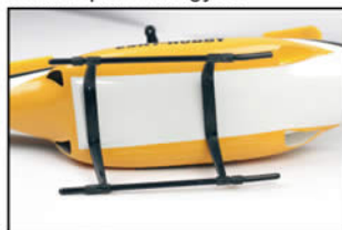
16.用四个自攻螺丝将机身固定 Fixup the fuselage with four self-tapping screws.