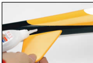
17.用AB胶将尾垂直翼粘好 Stick the tail Vertical fin with AB glue.