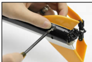
11.将尾齿轮箱组螺丝拧紧 Tighten the screws of the tail gear set