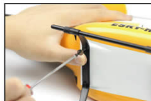
15.用自攻螺丝将脚架和机身安装好 Fixup the landing skid and fuselage with self-tapping screws.