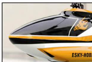
19.把机头罩装好 Assemble the canopy.