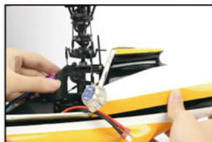
13.将机身往外抽出, 方便放置陀螺仪 Remove the fuselage outward, in order to place the gyro.