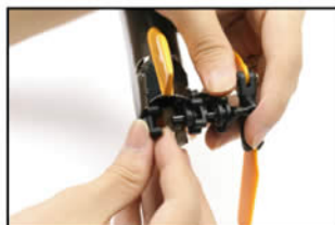
10.将尾齿轮箱组装好, 检查皮带是否能够顺畅运转 Assemble the tail gear box, and check to see if the belt can work smoothly.